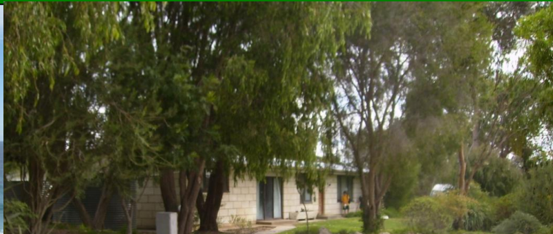
House in Karobran where we will live from Sept, is being worked on presently.