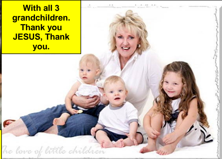
With all 3 grandchildren. Thank you JESUS, Thank you.