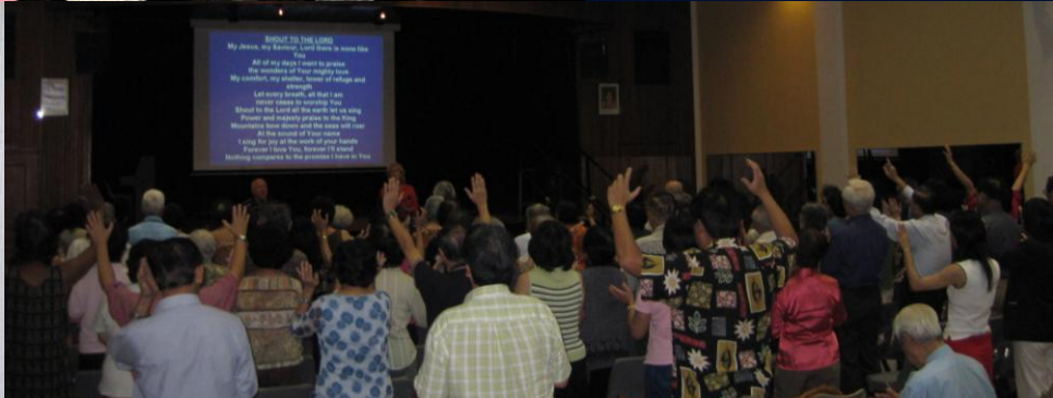
Lunchtime marketplace meeting for the Rose of Sharon Fellowship. Marketplace ministry is truly alive in Singapore