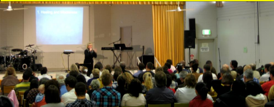
Above -- ministering for Hope Church in Adelaide.

Australia – A notable first for me was being the speaker at a Men’s camp for World Harvest Christian Church.